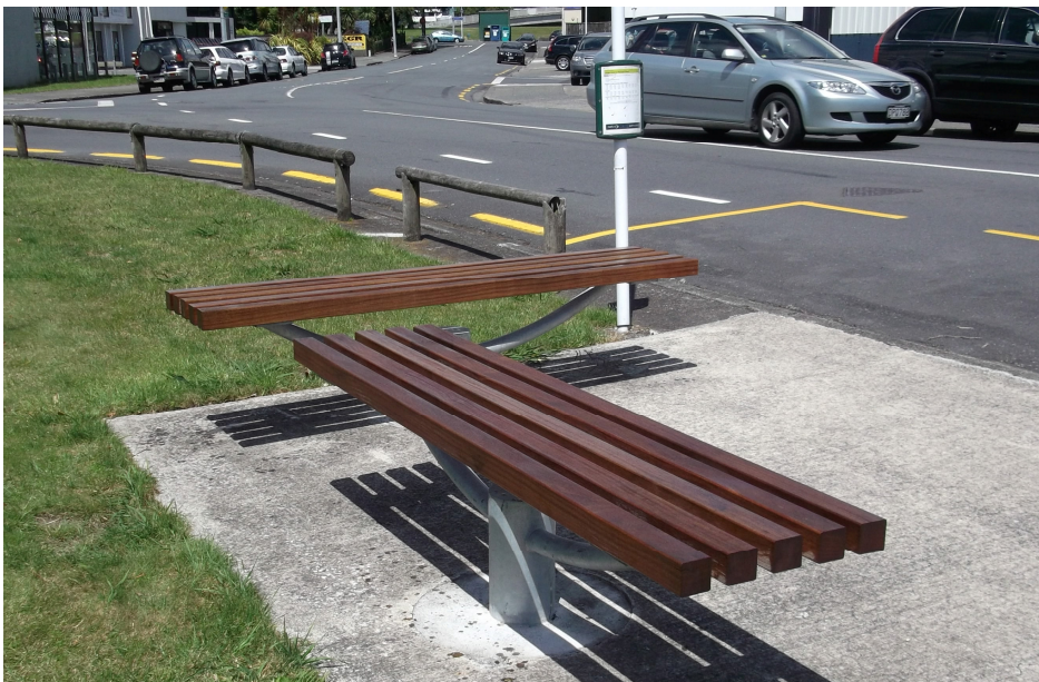
Seaview Benches used at a bus stop in Lower Hutt

The Seaview Bench has an overall length of 2000mm and comes with oil stain applied to the hardwood slats. Normally installed in-ground, it can also be supplied for surface mounting if required.